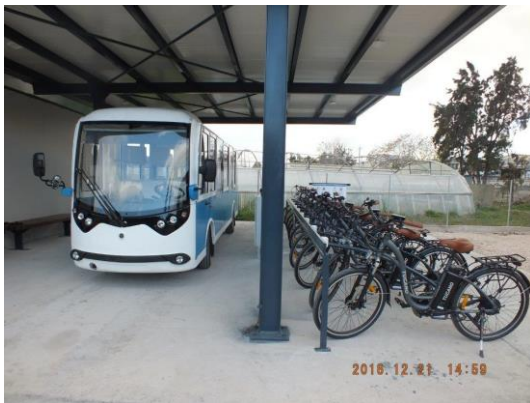
Image 6: Electric vehicles at the Agricultural University of Athens